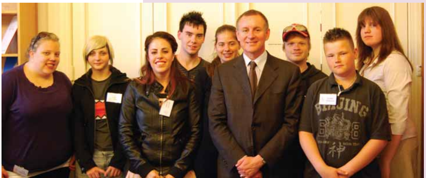
Young Carers meeting with the Minister for Education and Early Childhood Development Jay Weatherill, 24 September 2010

300 carers attended the National Carers Day movie morning.