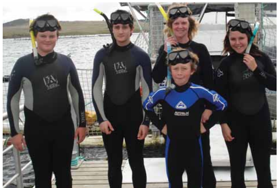
Eyre Carers Young Carers tuna farm activity