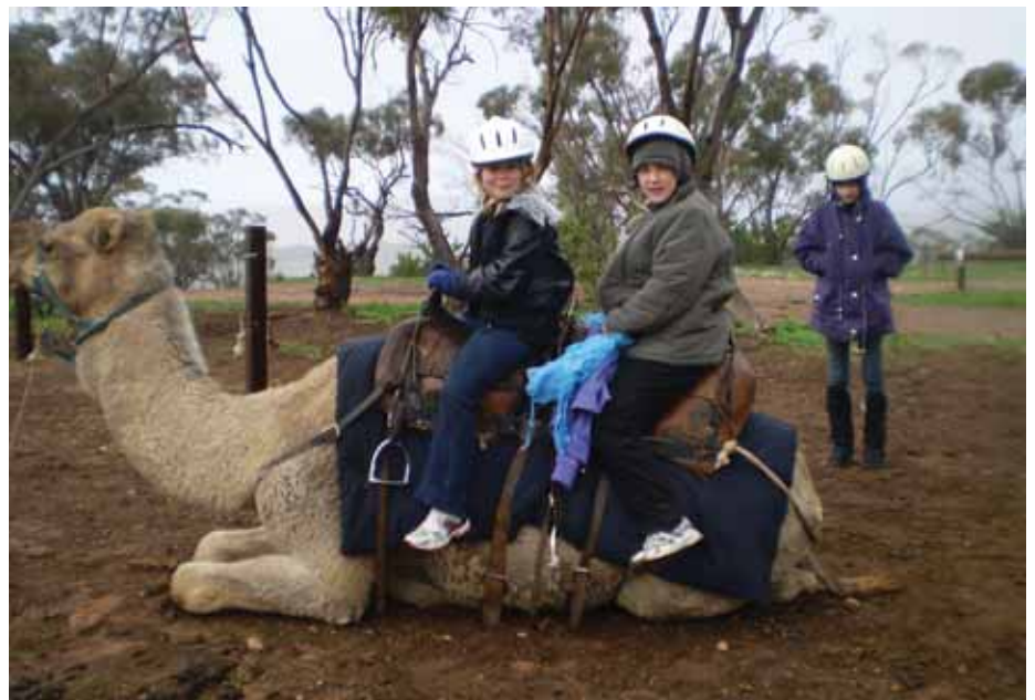
Retreat for Young Carers