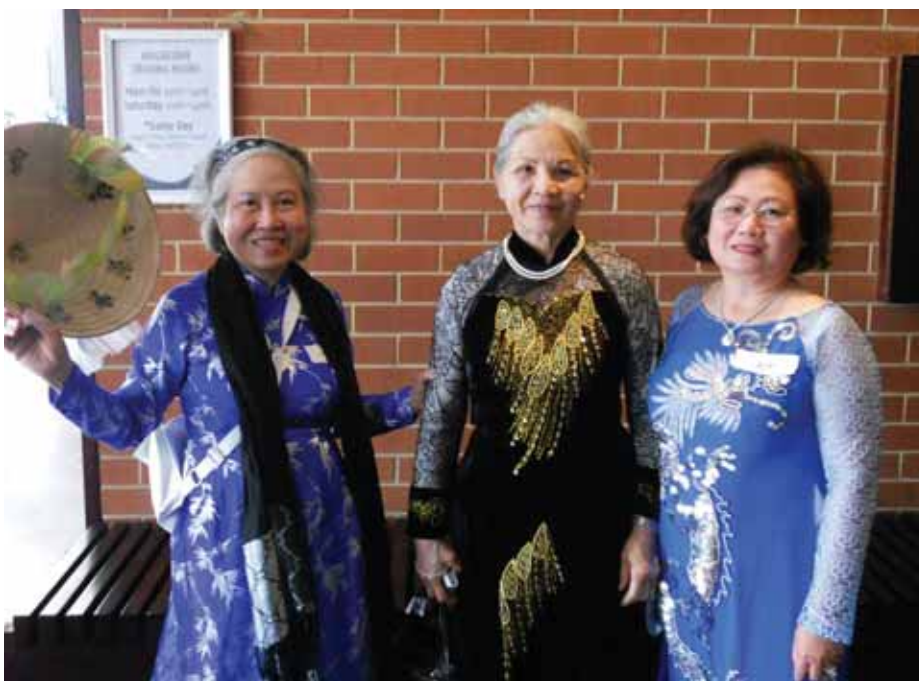
Melbourne Cup Luncheon