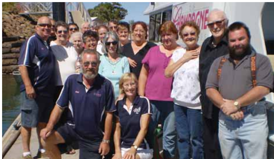
Enjoying a breather: Northern Country Carers boat cruise

Postal Address: PO Box 145 Mount Gambier 5290 Office Address: 20 Percy Street Mount Gambier 5290 Ph: 8724 8700 Fax: 8724 8744 Freecall: 1800 052 222 respitemill@carers-sa.asn.au