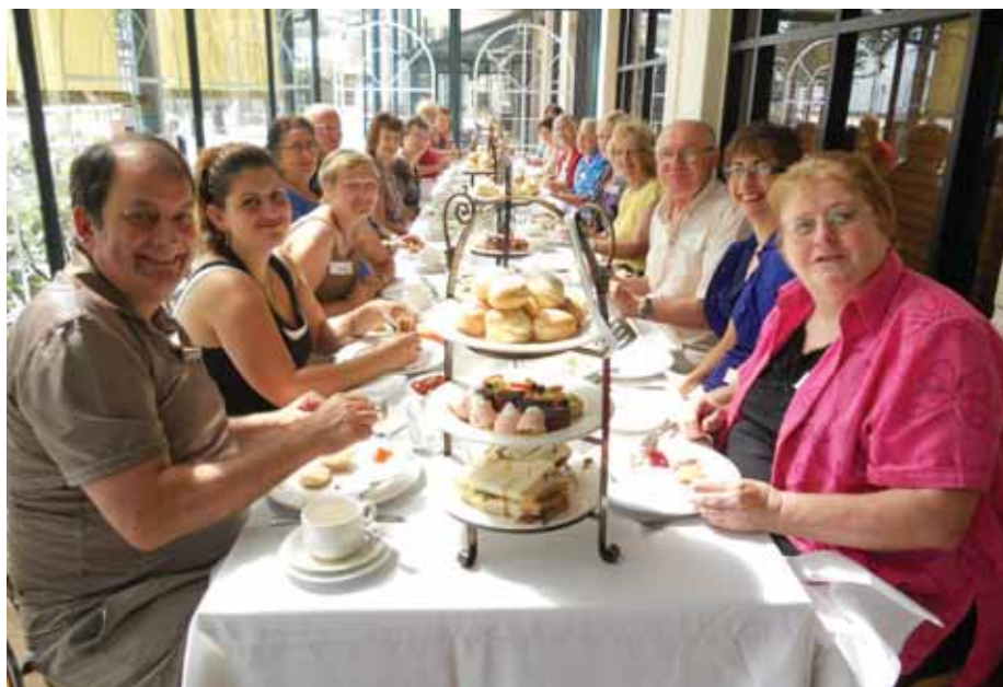
Indulgence Sunset Retreat