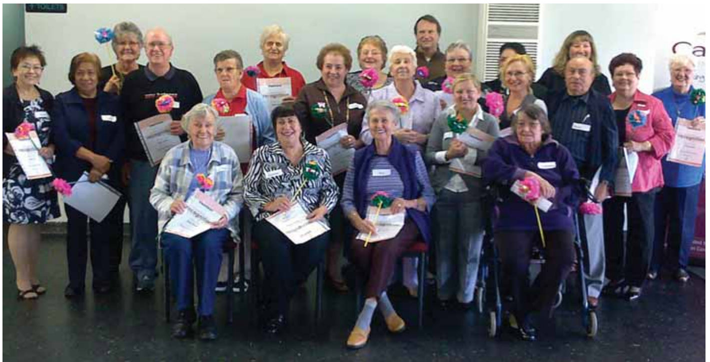
Western Carers acknowledging their volunteers at a Regional Celebration