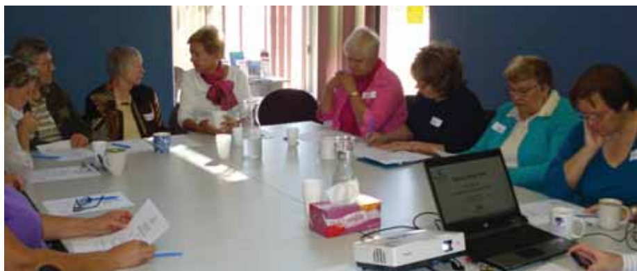
Have Your Say - CALD consultation - Western Carers