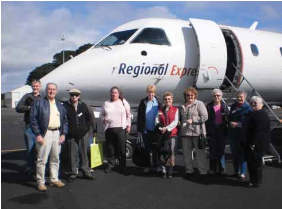
South East Carers